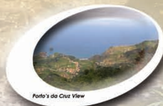
Porto da Cruz View