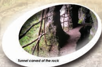
Tunnel carved of the rock