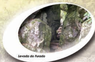
Levada do Furado