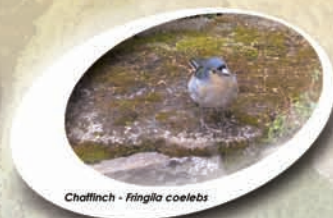
Chaffinch - Fringilla coelebs