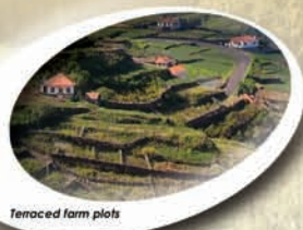
Terraced farm plots